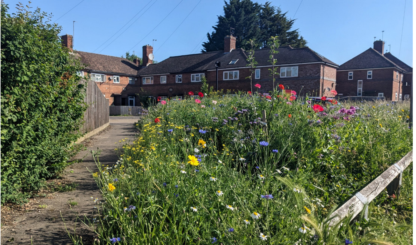
Planting in community garden, East Oxford