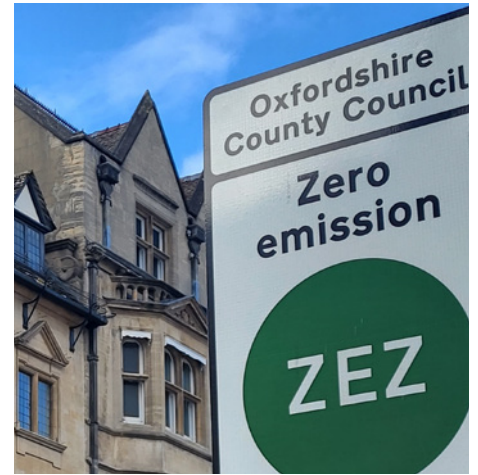
Oxford zero emission zone