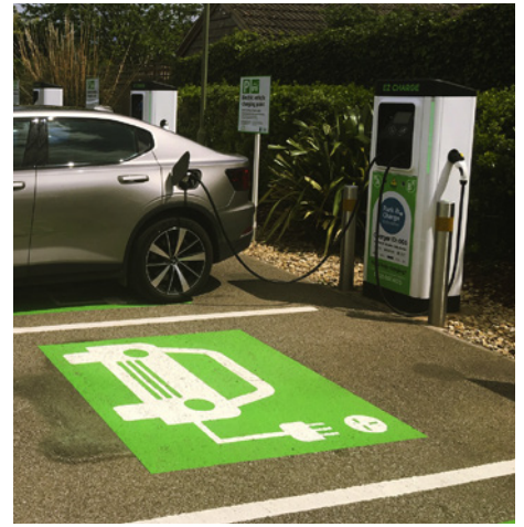
Park and charge site in Bicester

Oxfordshire County Council provides around 80 per cent of local government services in the county, including libraries, social care for adults and children, public health, highway maintenance, fire and rescue, waste disposal, emergency planning, trading standards and the registration service (births, deaths and marriages). It is also the local education authority. This makes it one of the largest employers in Oxfordshire, with a gross expenditure budget of £1,131 million in 2024–25.