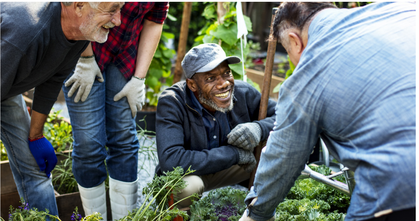
Locals discussing their harvests at one an allotment

Each GMI will detail which specific projects, asset or project themes the GMI is funding. Where eligible projects and assets are jointly funded between the Council and another party (e.g. central government), funding will be applied only to the Council's share of the eligible scheme.