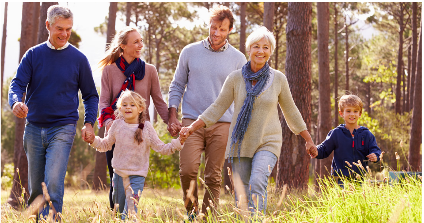
Extended family walking in Oxfordshire woodland

The council expects there to be adequate headroom of eligible assets and will endeavour to ensure that funds are disbursed to eligible assets within 36 months of the issuance of the green bonds and loans.